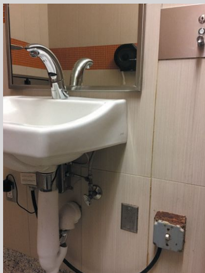
(Clockwise from top) Photo 3: A visual assessment of the cord depicting the plug and affixed manufacturer labeling and warnings, which should remain legible on the appliance. Photo 4: The result of a bathroom appliance installed without an electrical assessment; the switch is installed under a soap dispenser and the power plug is installed close to a sink, both of which create potential risk. Photo 5: An outlet tester can be used to test the outlet where an appliance will be placed, these tests should be documented to help formulate decisions.

determine suitability the safety professional must compare the manufacturer's information with the environment where the appliance will be used and the conditions of use. A process should be in place for meeting any ongoing requirements (e.g., maintenance), if any. As noted in Table 1 (p. 30), listing or labeling by an NRTL is a way to determine the suitability of equipment for specific purposes, environments or applications.